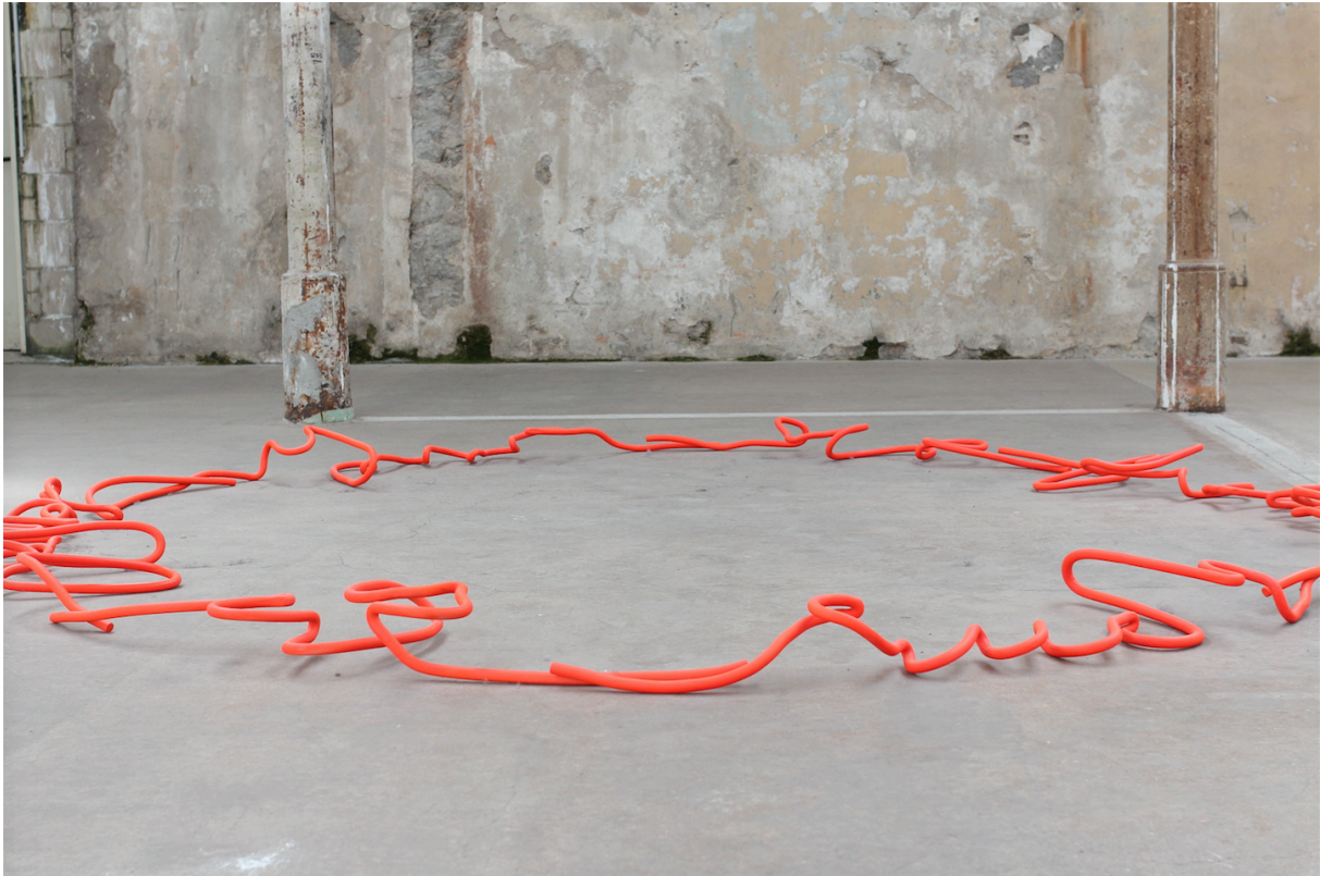
Enne Haehnle sowohlalsauch 2015 steel, varnish